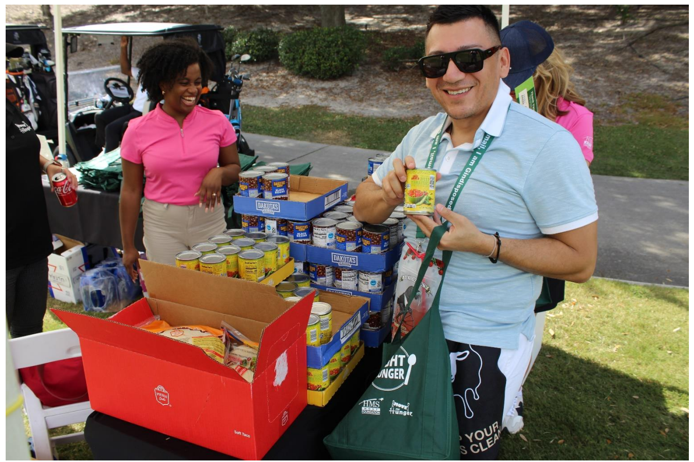
Golfers and volunteers packed 350 Meal Kits for families of four to help combat food insecurity in Central Florida.